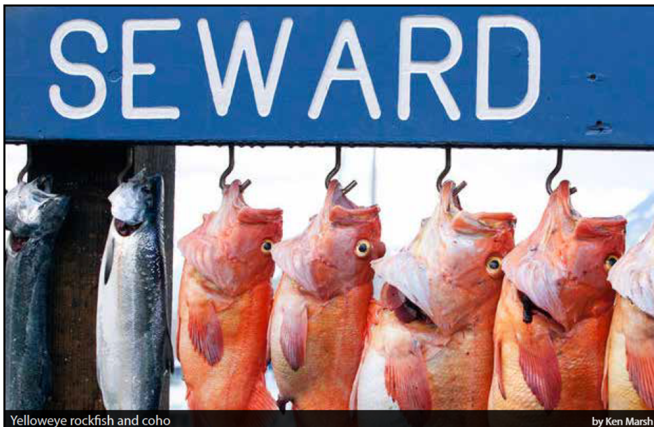
Yelloweye rockfish and coho