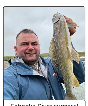
Echooka River success!