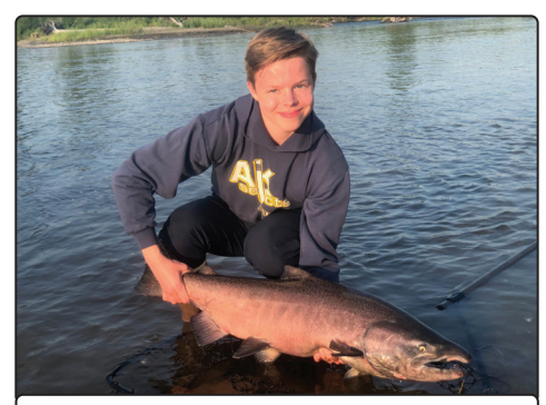
Gulkana River Chinook salmon.