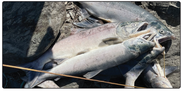
Dip net specifications for all personal use fisheries:

By regulation, a dip net is defined as a bagshaped net supported on all sides by a rigid frame. The maximum straight-line distance between any two points on the net frame, as measured through the net opening, may not exceed 5 feet. The depth of the bag must be at least one-half the greatest straight-line distance as measured through the net opening. No portion of the bag may be constructed of webbing that exceeds a stretched measurement of 4½ inches. The frame must be attached to a single rigid handle and be operated by hand.