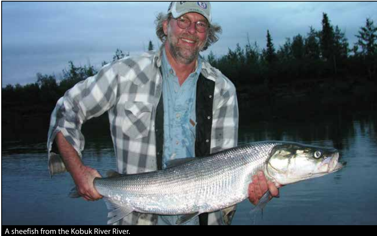
A sheefish from the Kobuk River River.