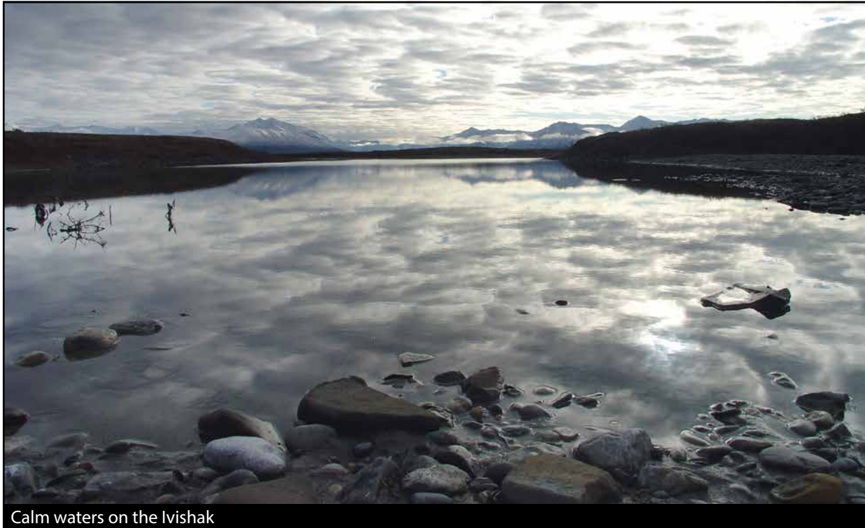
Calm waters on the Ivishak