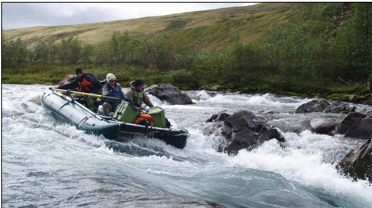
Rafters on the Kisaralik River