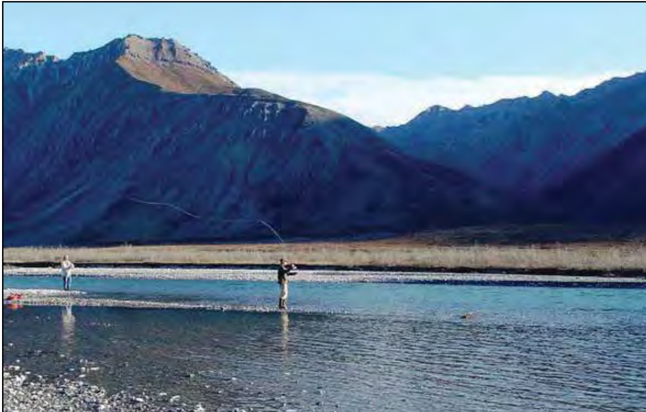
Fly fishing on the Ivishak River