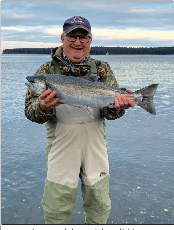
A successful day of shore fishing.