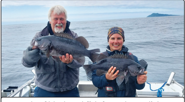
A couple of black rockfish from the Kodiak area.