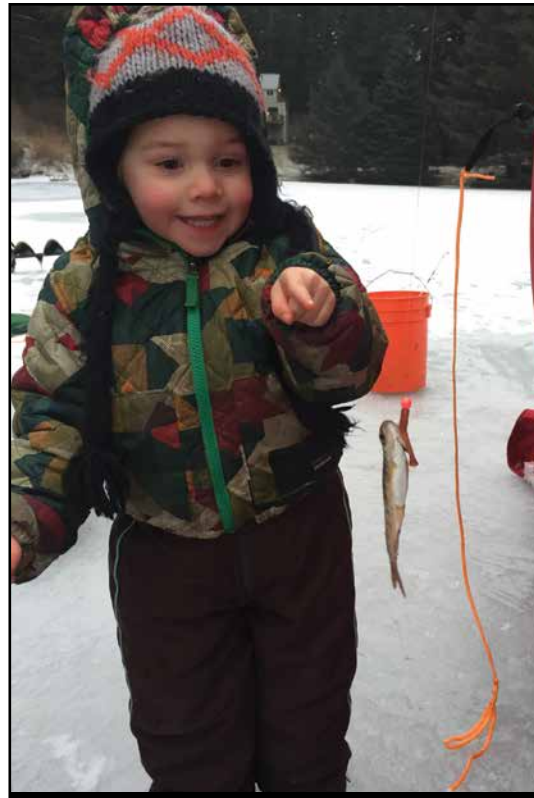
Success at Island Lake in Kodiak