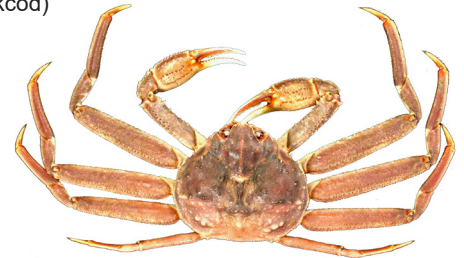
Tanner crab.