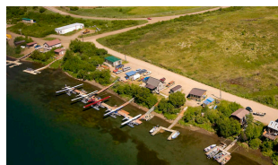
King Salmon docks.