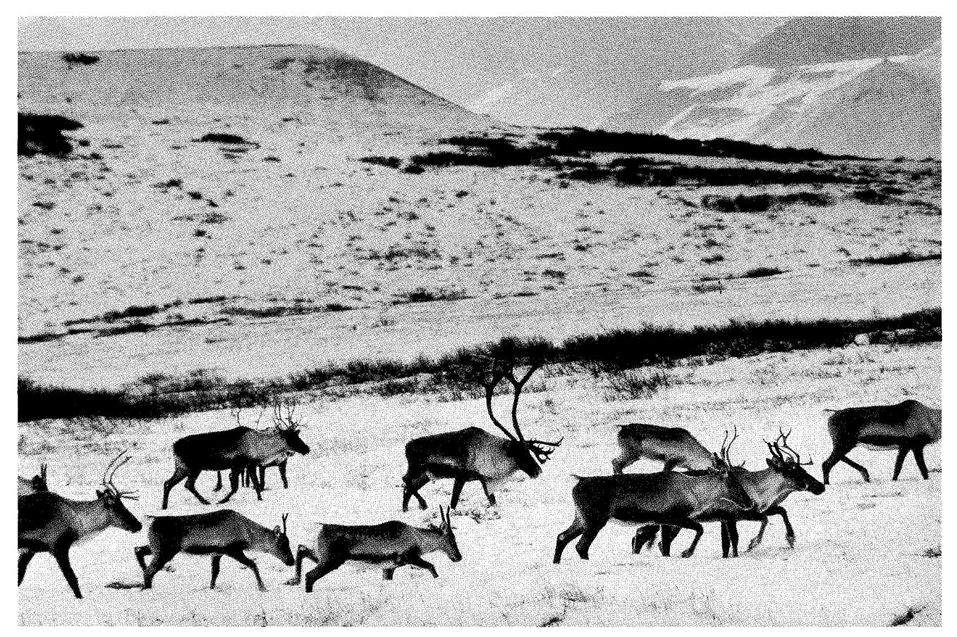
Fig. 3. Caribou are secondary prey of wolves in most of central Alaska; moose are the primary prey. Waiting for caribou numbers to increase in hopes that predation on moose will decline is not a viable strategy for attaining management objectives. When caribou increase in numbers, they often move beyond the range of resident wolf packs and leave the resident moose with relatively high predation rates.

as wolverines ( Gulo gulo ). Species-specific delivery systems will be required, thereby necessitating further development costs.