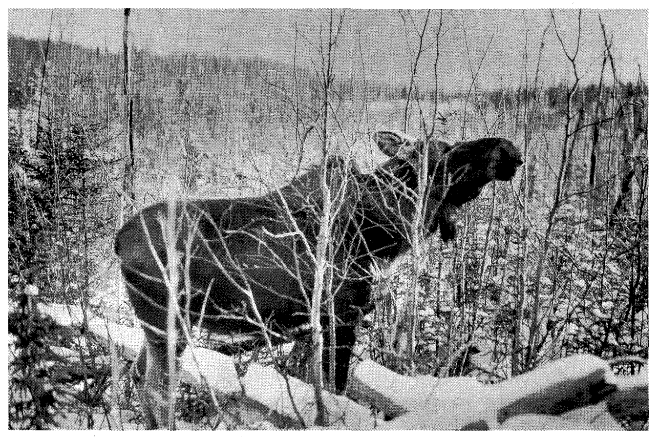
Fig. 2. Moose in a 24-year-old burn on the Kenai Peninsula, Alaska. Ideal moose habitat can occur 10 to 30 years after wildfire in Alaska, and moose density is often relatively high in these habitats.

tion and movement studies indicate that birth control may have low to moderate effectiveness in reducing predation for several reasons. First, the maintenance of wolf pairs in an exploited population can result in significantly higher per capita wolf kill rates (Hayes et al. 1991). Second, ingress of subadult wolves into wolf control areas may offset the results of birth control. For example, in a highly exploited wolf population in south central Alaska, 28% of 135 wolves dispersed, and 22% of dispersers were accepted into existing packs (Ballard et al. 1987). Immigrating wolves may be accepted at a greater rate in an area where birth control is practiced. Also, lightly harvested adjacent populations may have a greater percentage of dispersing wolves than observed in the highly exploited wolf population in south-central Alaska. Ingress would be less significant if treated wolf populations were insular or peninsular. Translocation of young wolves combined with sterilization of adult pairs may significantly reduce predation.