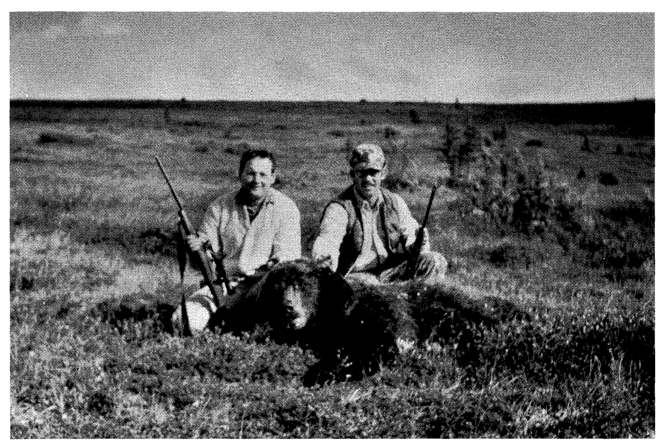
Fig. 4. Conventional public harvest of bears can be used as a management tool to reduce predation on moose calves. At the same time, managers can protect the viability of bear populations.

and education. Liberalized hunting regulations included: lengthening the hunting season, deleting a resident grizzly bear tag (fee) requirement, and increasing the bag limit to one bear/year, as opposed to the usual bag limit of one bear/four years. The harvest of sows accompanied by cubs and yearlings was not authorized.