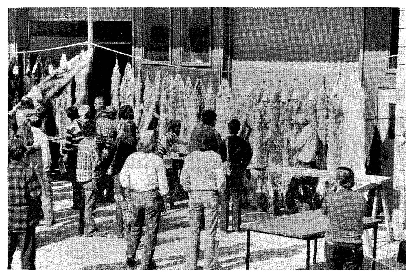
Fig. 5. Wolf hides collected during agency wolf control programs have been auctioned to the public.

Boertje et al. 1996). The public has reduced wolf numbers using light, fixed-wing aircraft in areas with high proportions of unforested, open terrain and suitable snow conditions for tracking and landing. Large portions of interior Alaska north of the Alaska Range are ill-suited to this method. The use of aircraft was discontinued where wolves were extremely vulnerable (e.g., portions of northern and northwestern Alaska). In these areas, snowmachines replaced aircraft as a tool to effectively reduce or regulate wolf numbers.