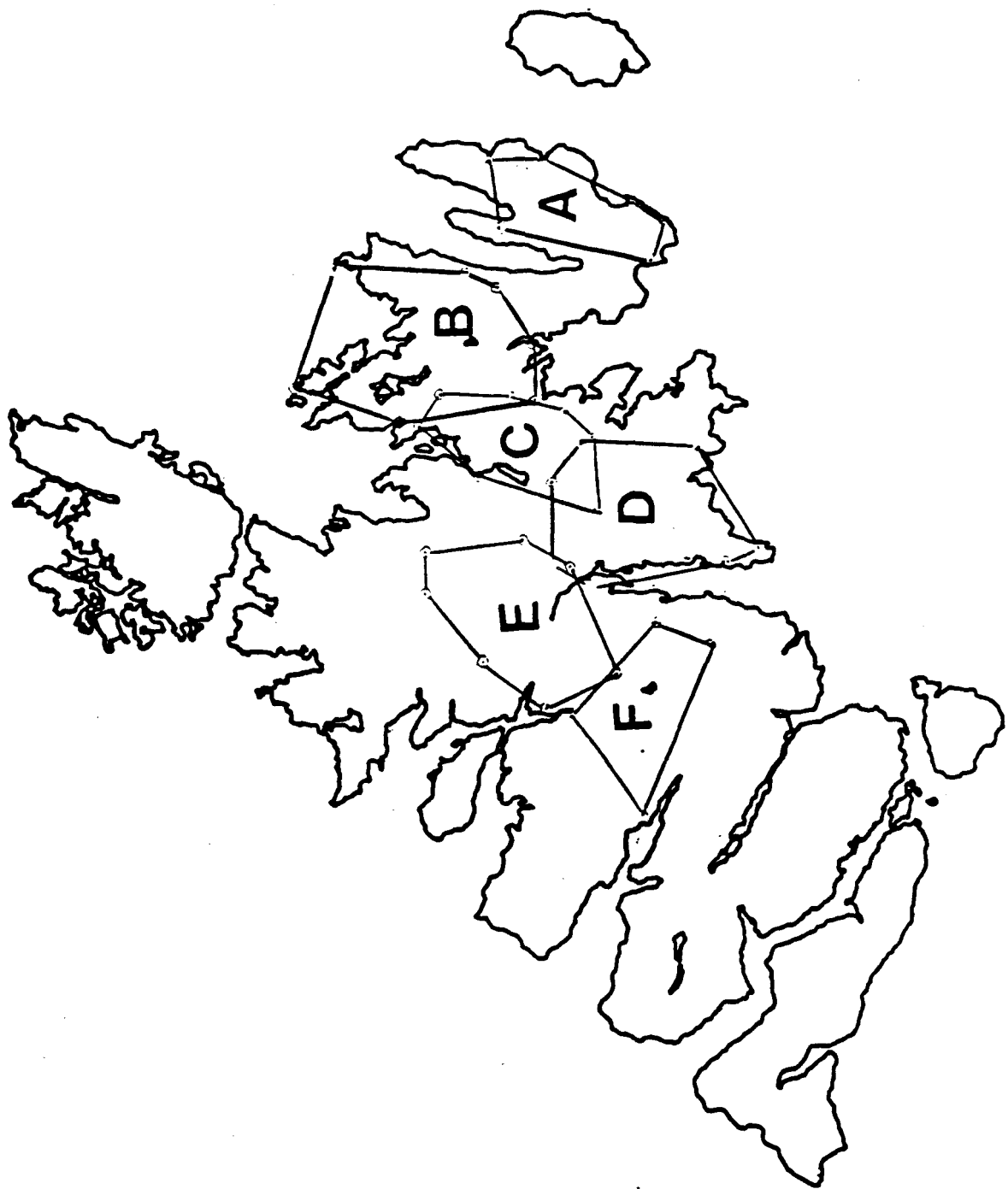
Figure 1. Home range polygons for six Afognak Island elk herds, 1986-1990.