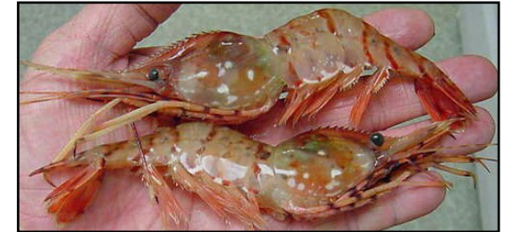
COONSTRIPES SHRIMP ( S. HYP SINOTIS )