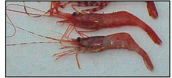
(TOP) HUMPY SHRIMP ( P. GONIURUS ) NORTHERN SHRIMP ( P. BOREALIS )

Keep in mind that many areas of Prince William Sound experience strong ocean and tidal currents. Add enough weight and line to keep your pot from breaking away. In order to be successful at shrimping, you may have to have several favorite spots.