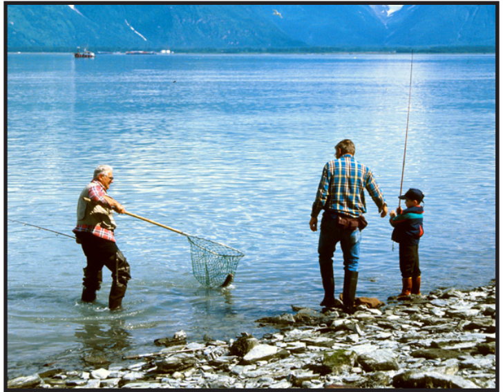
A young Allison Point shore angler has help landing a pink salmon.

Licenses and stamps can be purchased at most grocery stores and tackle shops or on-line at www.adfg.alaska.gov/store .