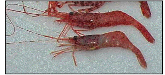
(TOP) HUMPY SHRIMP ( P. GONIURUS ) NORTHERN SHRIMP ( P. BOREALIS )

Keep in mind that many areas of Prince William Sound experience strong ocean and tidal currents. Add enough weight and line to keep your pot from breaking away. In order to be successful at shrimping, you may have to have several favorite spots.