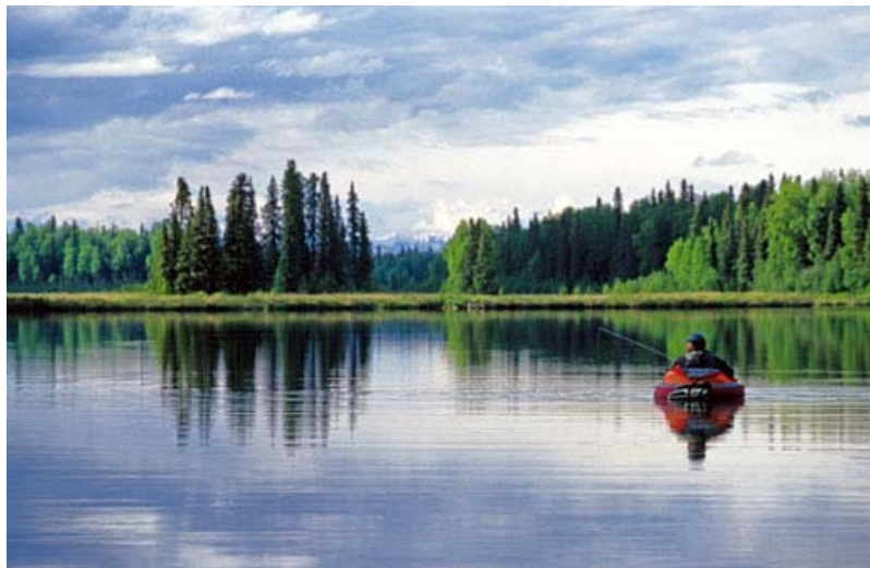
Anglers enjoy good fishing and plenty of solitude in Valley lakes.