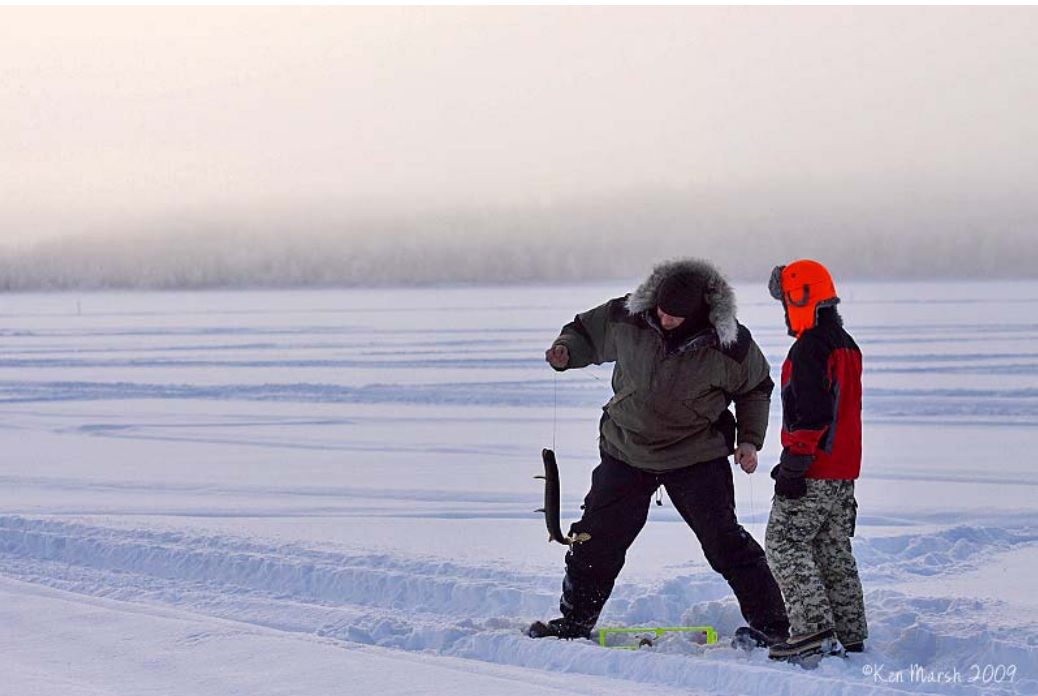
A father and son target northern pike through the ice. Valley lakes offer good fishing year round.

Regulations for lakes with state land (Alaska Ad-