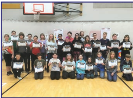
Fronteras Spanish Immersion School and Teeland Middle School 2019-2020 Academic Archers