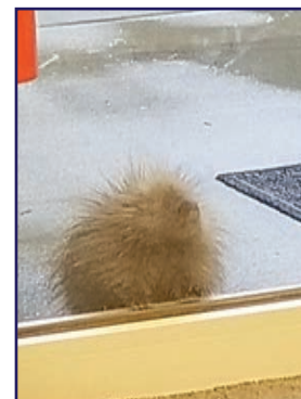
This little guy really wanted to be a part of the Juneau hunter ed class

Your regional coordinator has sent out an email invite or will be sending an email invite out shortly. If you don't hear from them and want to attend, check your spam email inbox or give them a call to find out the teleconference details.