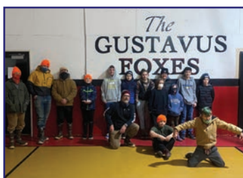
Gustavus hunter ed class

We're approaching the home stretch of not only 2020 but our certification course offerings for the year as well. While 2020 has been quite a doozy, it has just continued to reinforce how amazing our HIT Program volunteers are. So many of you stepped up in a huge way by instructing certification classes this year, and those not comfortable in social situations, communicated and reached out to HIT Program staff to let us know you're still there which is also greatly appreciated.