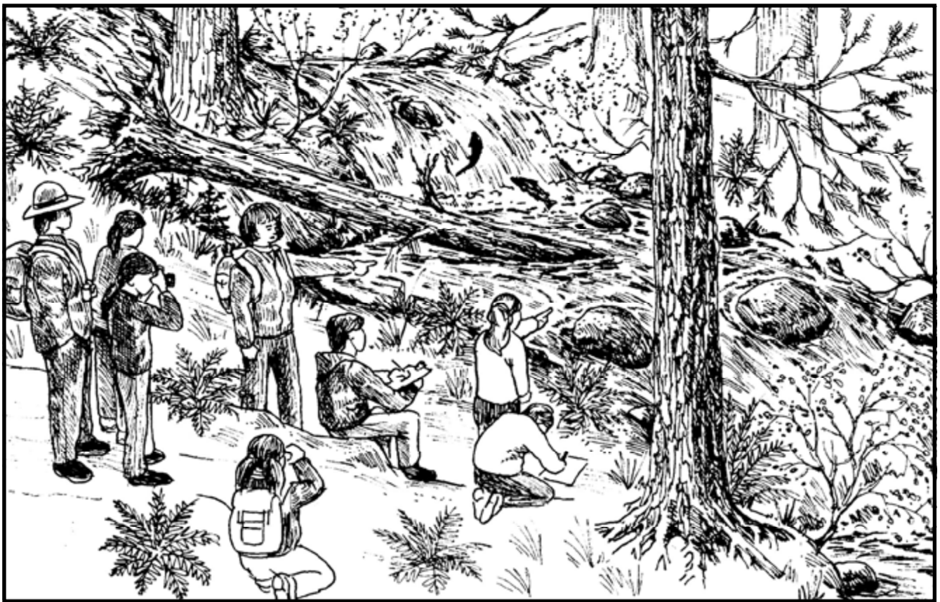
Illustration: Donald Gunn