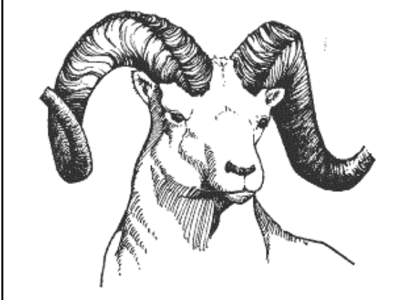
Figure 3 - Annual horn rings