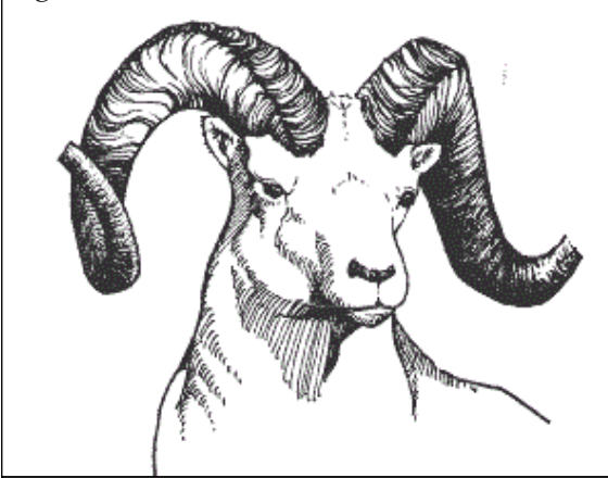
Figure 3 - Annual horn rings