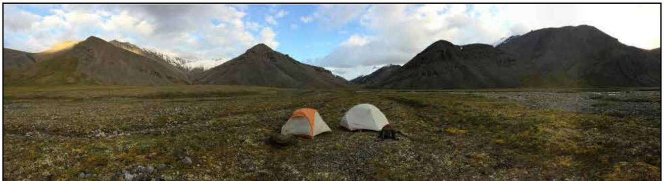
Sheep hunting camp in the Brooks Range.

*Hunt numbers starting with a "C" = Community, "D" = Drawing, "HT" = Harvest ticket, "R" = Registration, "T" = Tier II. See pages 14-15.