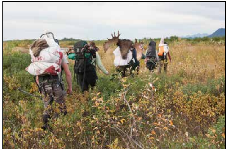
A hunting party packs out a moose in the Copper River Delta.