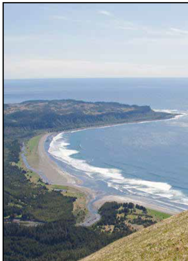
San Juan Bay, Montague Island