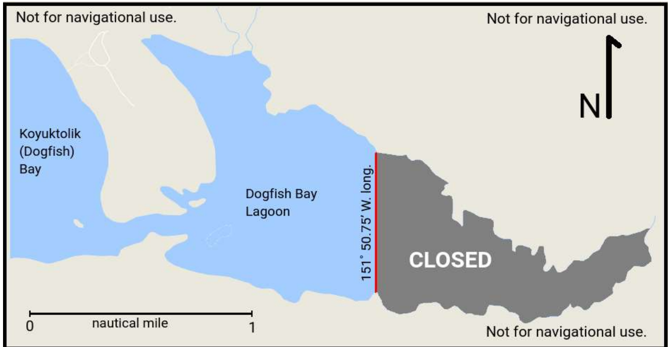
Figure 1.- Koyuktolik (Dogfish) Bay showing waters open to commercial purse seine harvest west of 151° 50.75' W. longitude.

OUTER DISTRICT: Effective Friday, July 20 at 6:00 AM, Dogfish Bay Lagoon west of 151° 50.75' W. longitude will open for a single sixteen hour fishing period from 6:00 AM to 10:00 PM on that date. Anadromous waters closures are suspended for the portion of Dogfish Bay lagoon west of this line.