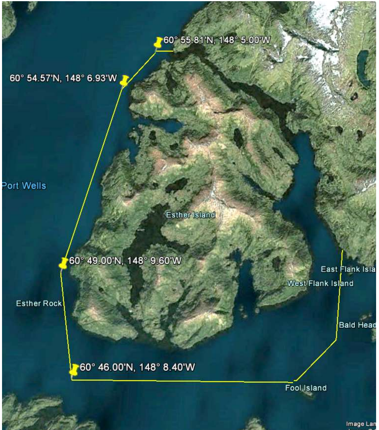
Esther and Granite Bay Subdistrict Adjusted Open Area, June 26, 2017.