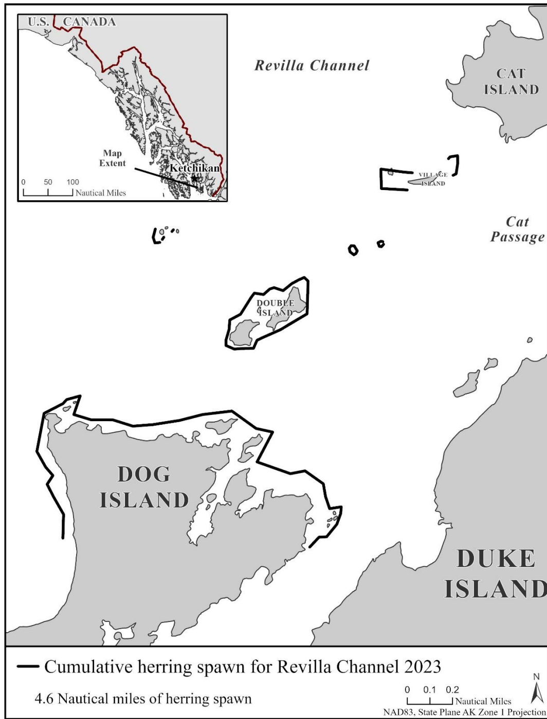
Figure 2. Cumulative herring spawn for Revilla Channel 2023.

Advisory Announcement web site: http://www.adfg.alaska.gov/index.cfm?adfg=cfnews.main .