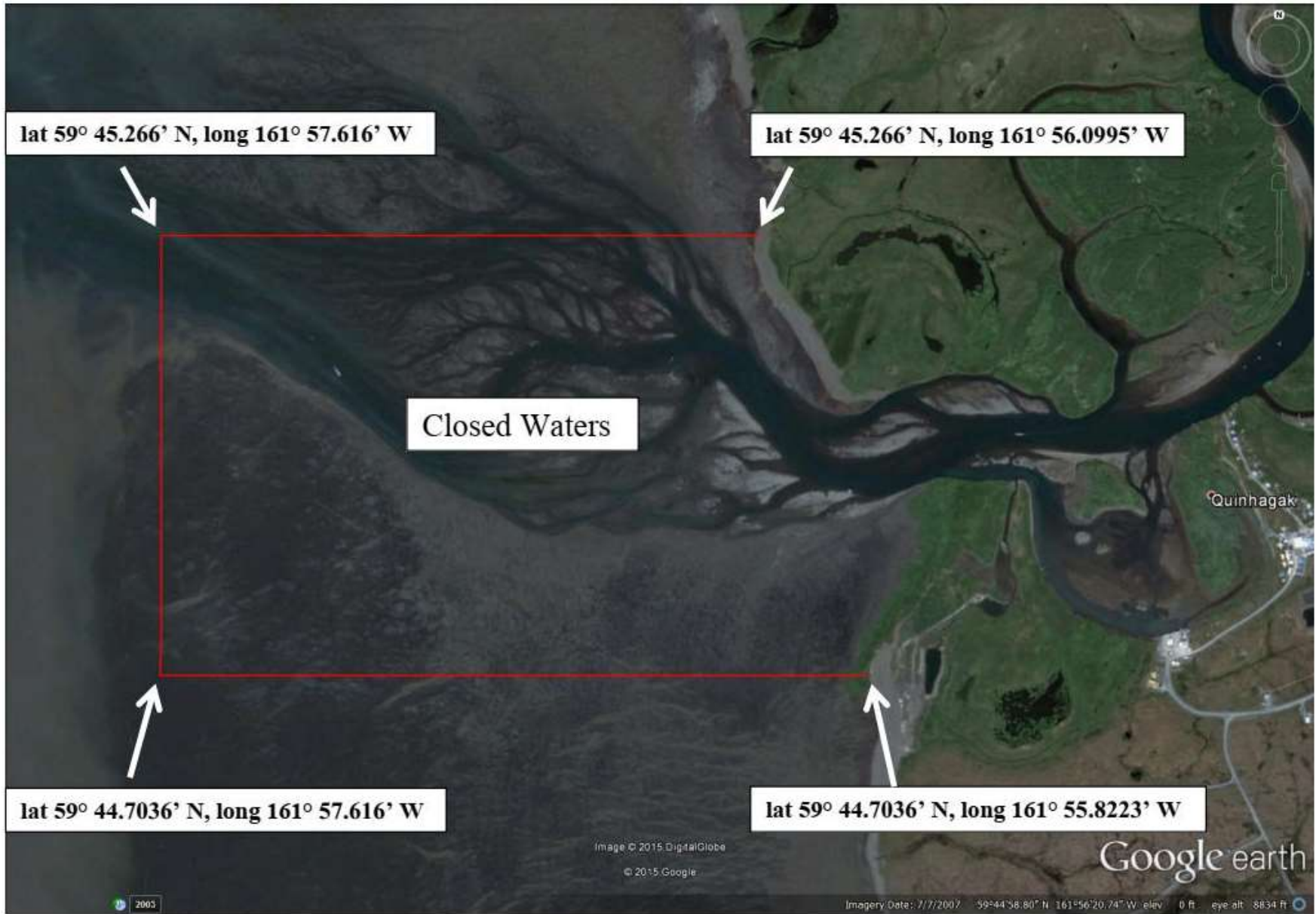
Figure 2. Closed waters for District 4, Quinhagak.