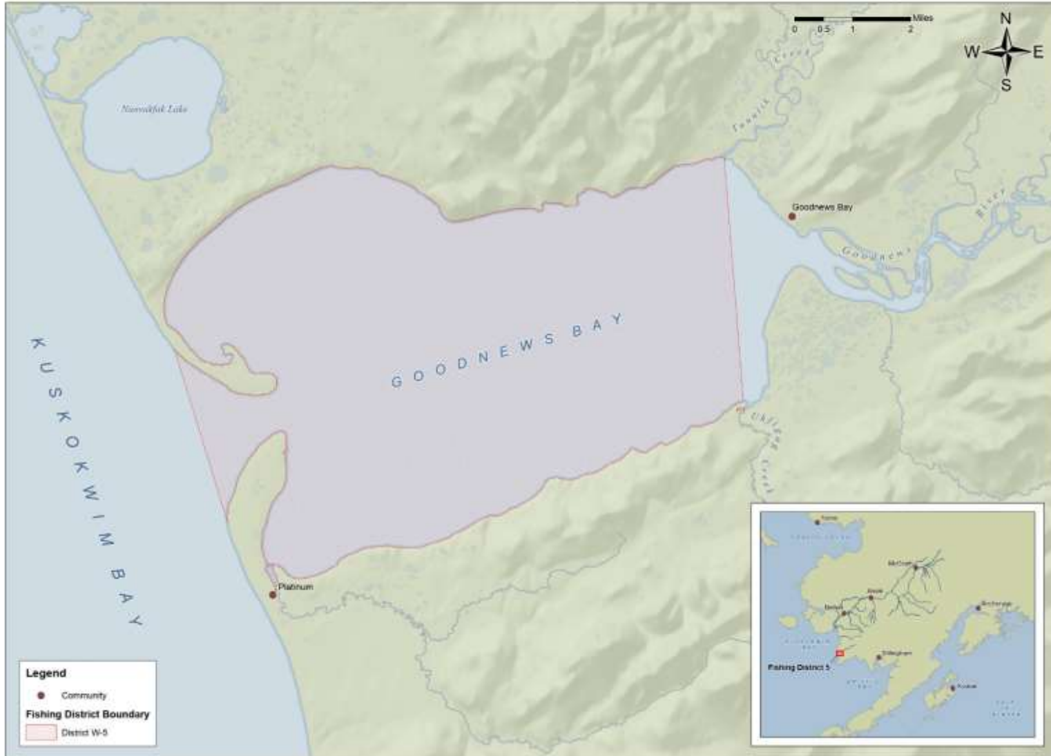
Figure 3. Map of District 5, Goodnews Bay.

As defined in 5 AAC 07.200, District 5 consists of that portion of Goodnews Bay east of a line from an ADF&G regulatory marker located approximately two miles south on the seaward side entrance of Goodnews Bay to an ADF&G regulatory marker located approximately two miles north on the seaward side of the entrance of Goodnews Bay and west of a line between the mouth of Ukfigag Creek at 59° 04.17' N. lat., 161° 36' W. long. and the mouth of the Tunulik River at 59° 08' N. lat., 161° 37' W. long.