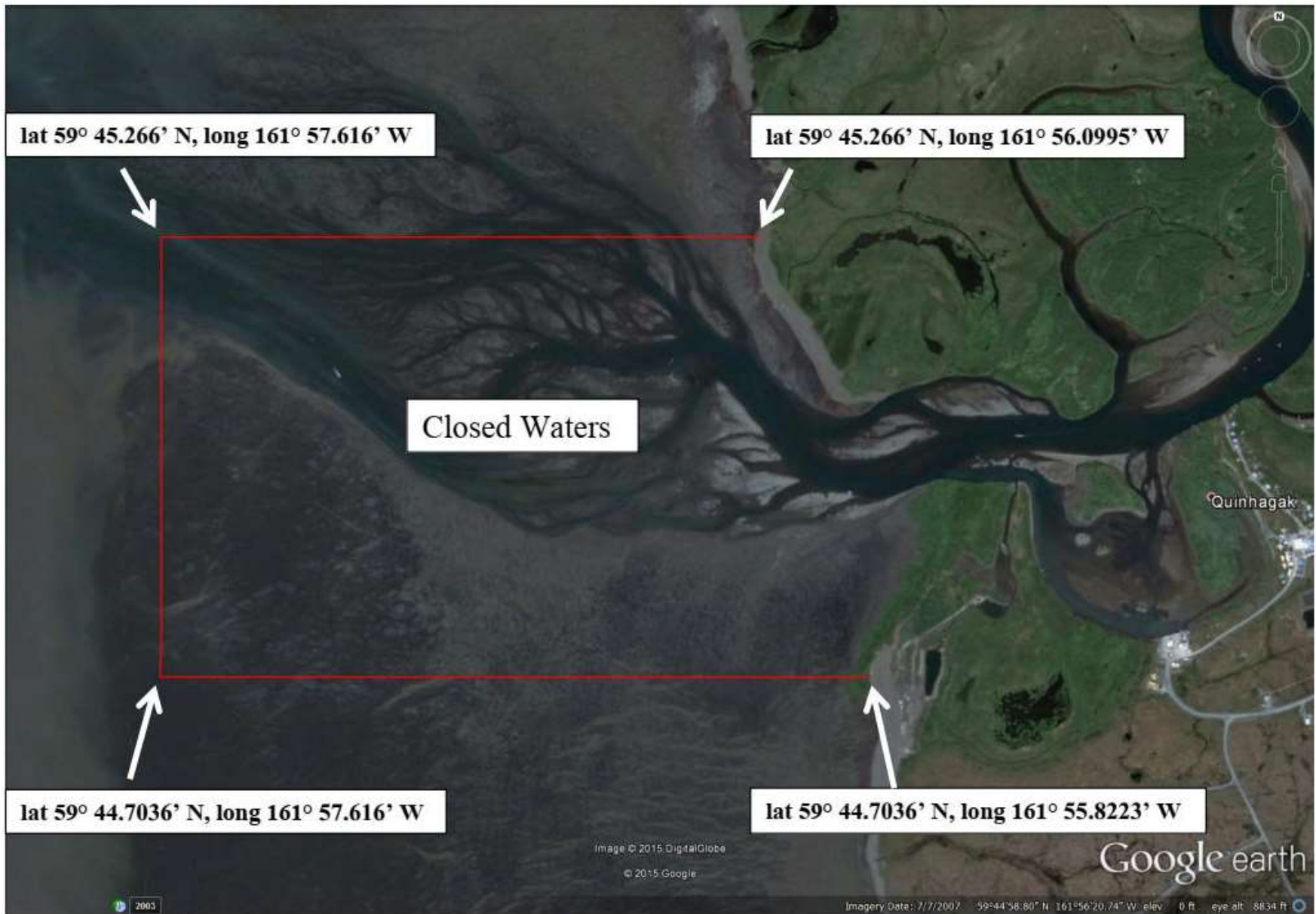
Figure 2. Closed waters for District 4, Quinhagak.