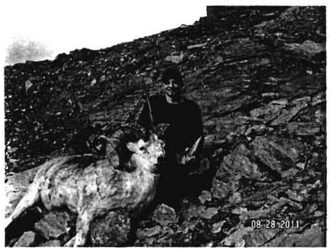
Fairbanks Daily News Miner

Largest ram harvested in the TMA in 2011 was taken by an un-guided Alaska resident (horns >44 inches in length).