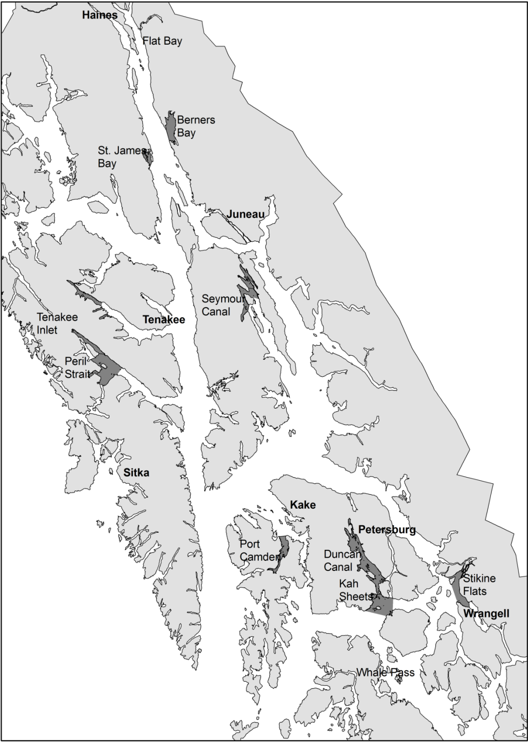
Figure 2.1–Dungeness crab survey locations in Southeast Alaska.