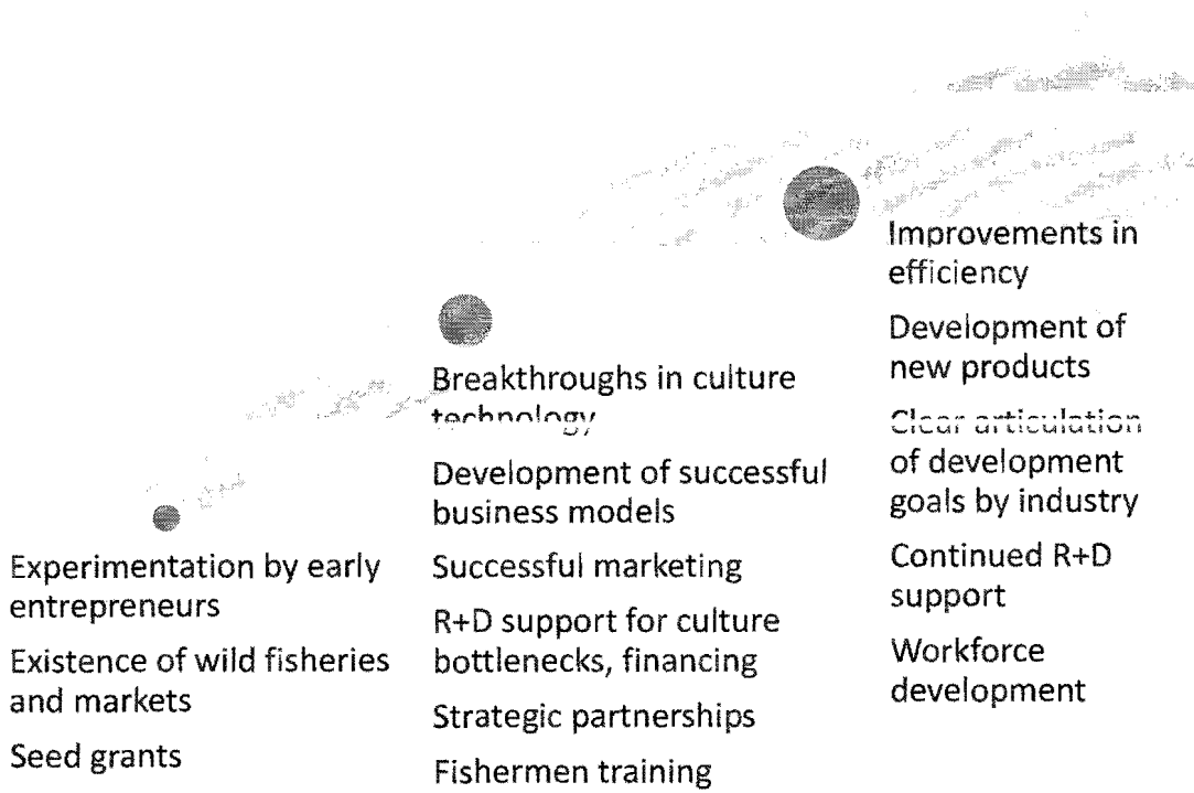
Figure ES-2. Elements of Successful Mariculture Industry Growth

Source: Maine Shellfish Research and Development, 2015