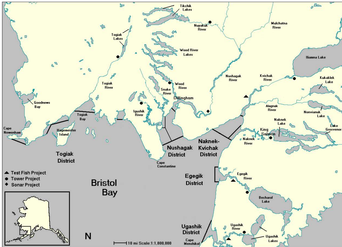
Figure 1.—Major river systems, escapement enumeration projects, and commercial fishing districts.