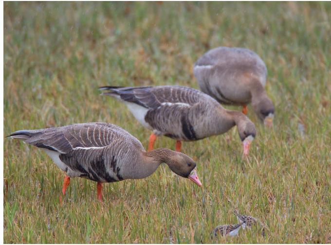
GREATER WHITE-FRONTED GOOSE