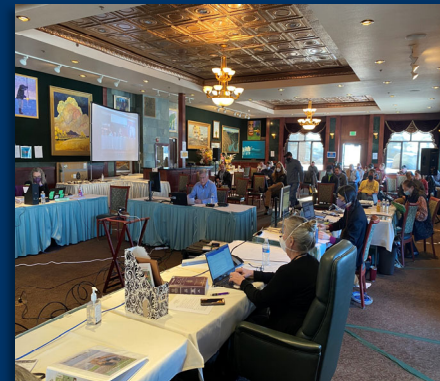
The Board of Game held its statewide meeting in March at the ornately decorated Pike's Waterfront Lodge in Fairbanks.