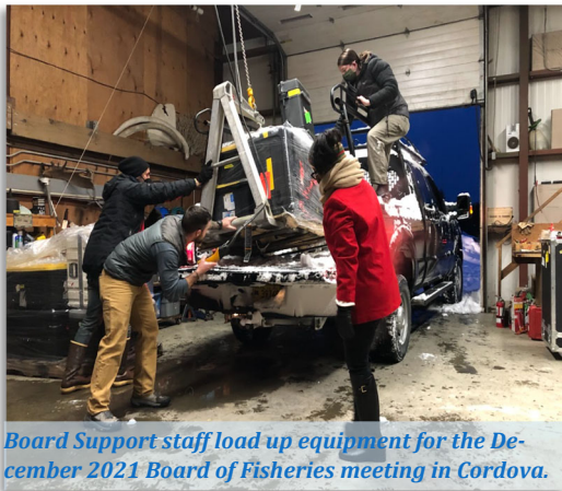
Board Support staff load up equipment for the December 2021 Board of Fisheries meeting in Cordova.

Regional coordinators adapted board meeting practices to mitigate the spread of COVID-19. They worked together to set up a registration system and devise a number of ways to participate in board meetings remotely. ADF&G staff were able to present to the board using Zoom and meetings were streamed live on YouTube so that the public could follow along from home. During some meetings, members of the public were able to testify by phone and could submit materials to the board via e-mail. These innovations allowed the boards to conduct business as usual while reducing the risk of an outbreak.