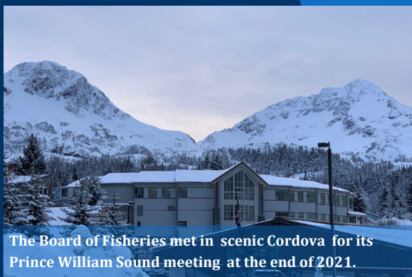
The Board of Fisheries met in scenic Cordova for its Prince William Sound meeting at the end of 2021.