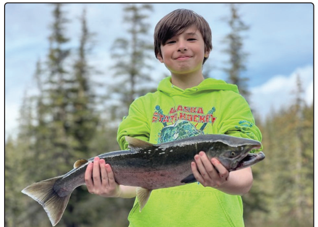
Coho salmon from Taku River.