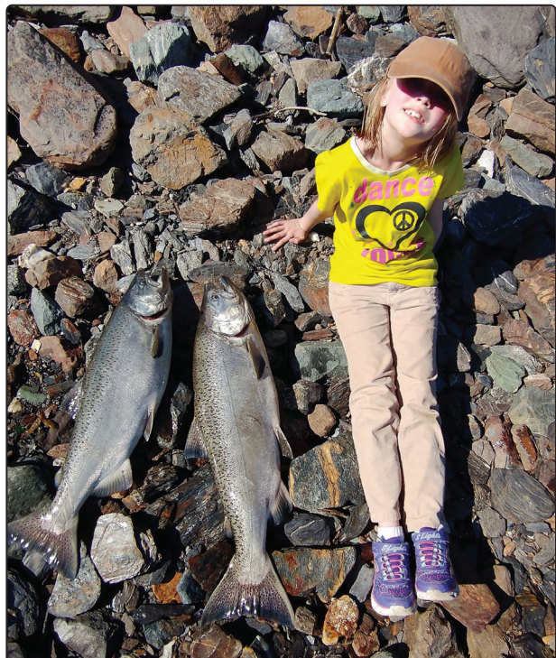
Limits obtained from Snowslide Creek.