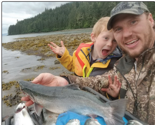
Take your kiddo fishing at Excursion Inlet.