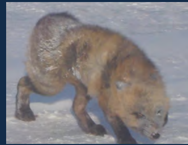
Top: rabid arctic fox found dead near Deadhorse, Alaska.