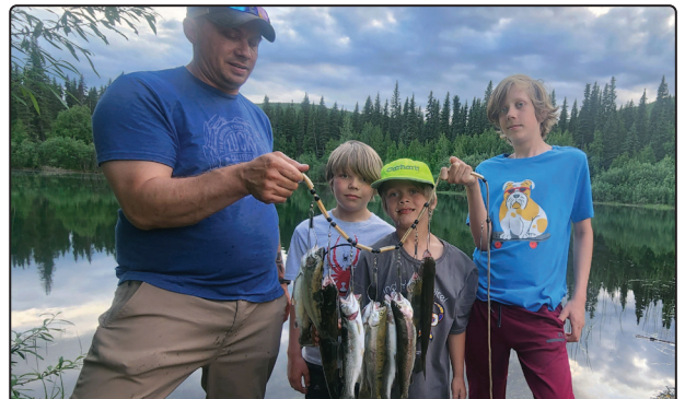
A successful day of fishing with the family.

Nonresident Military Annual Sport Fishing License ..... $20 Only for active duty military service members permanently stationed in Alaska for less than 12 months or for their dependent(s).