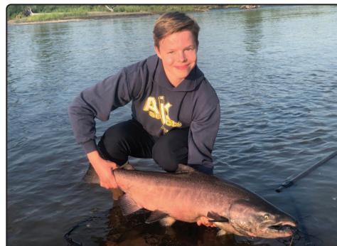
Gulkana River Chinook salmon.