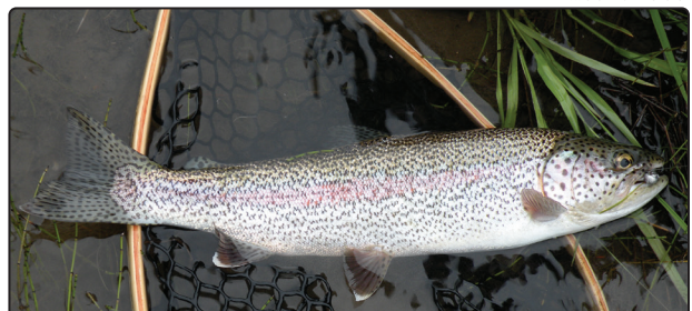
Rainbow trout from the Kisaralik River.