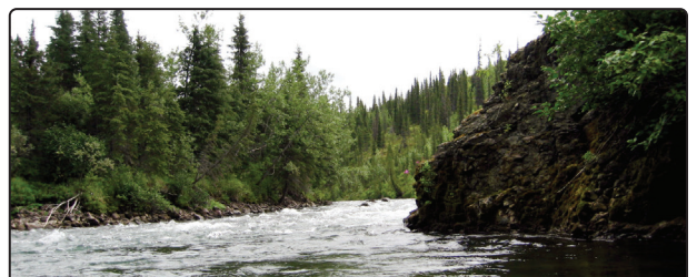
Aniak River and Kipchuk River confluence.