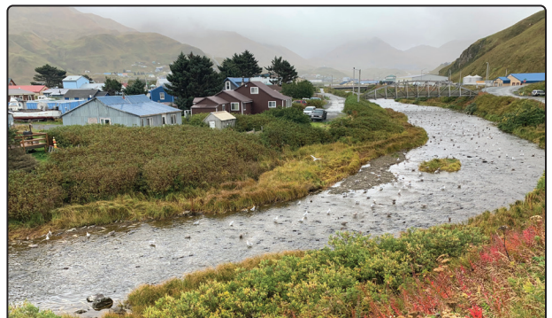
Iliuliuk Creek in Unalaska.

Nonresident Military Annual Sport Fishing License ..... $20 Only for active duty military service members permanently stationed in Alaska for less than 12 months or for their dependent(s).