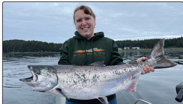
Woody Island Chinook salmon.