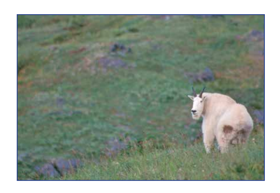
Answer #15 Billy

Gradual curve to entire length of horns, thick horn base close together. Scrotum visible.