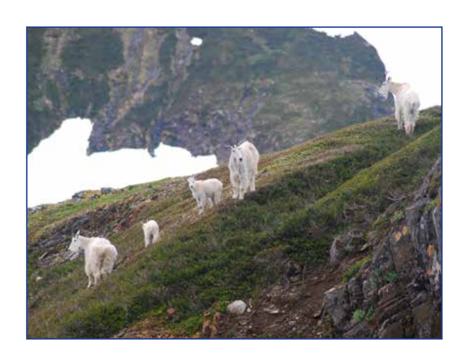
Answer #8 3 nannies and 2 kids, July

Straight, thin horns with wide space between bases, pronounced curve towards tips, offspring close by.