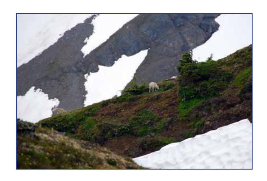
Answer #11 Nanny with kid