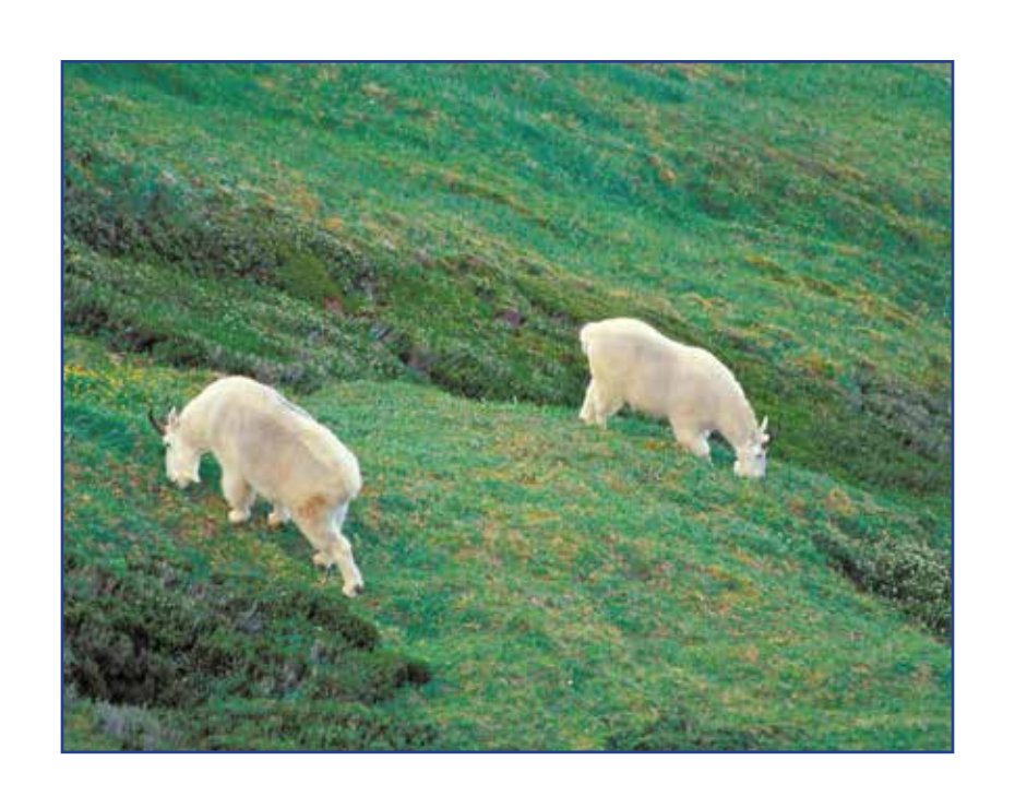
#17 Billies or Nannies?