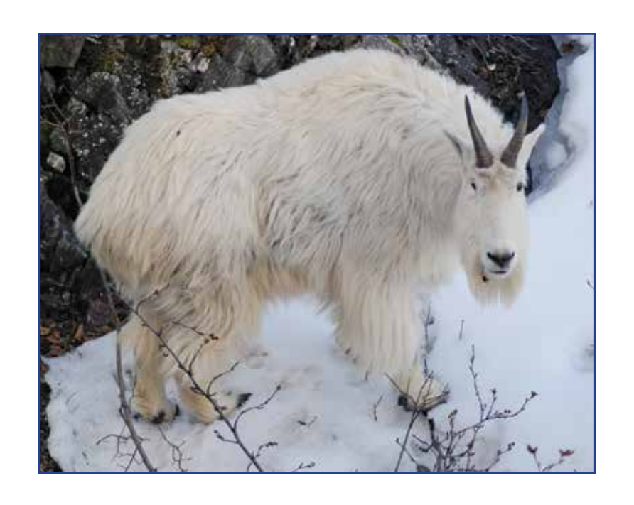
Billy or Nanny?