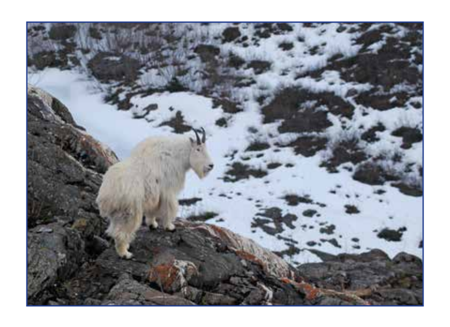
Answer #18 7-year old billy, March

Stocky body, gradual curve to entire length of horns.