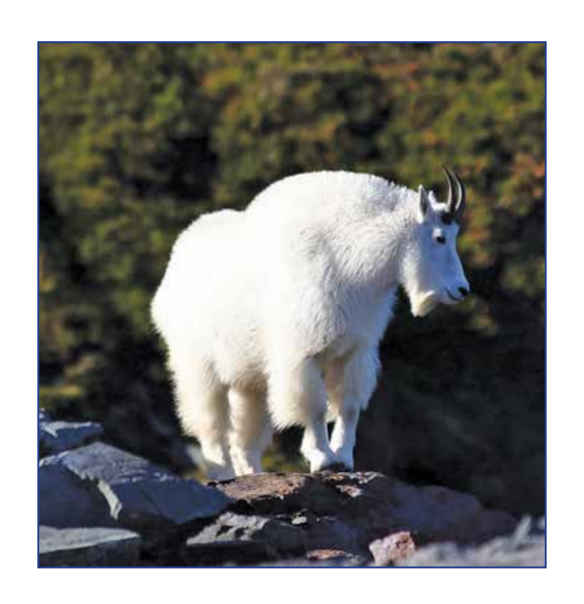
#12 Billy or Nanny?