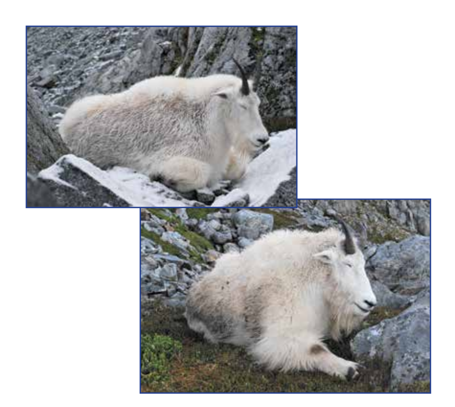
Which is the billy? Which is the nanny?