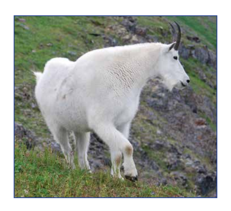
Answer #10 Nanny, July

Straight, thin horns, pronounced curve towards the tips.