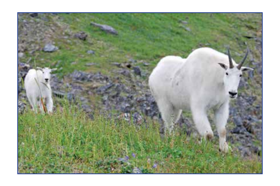
Billy or Nanny?