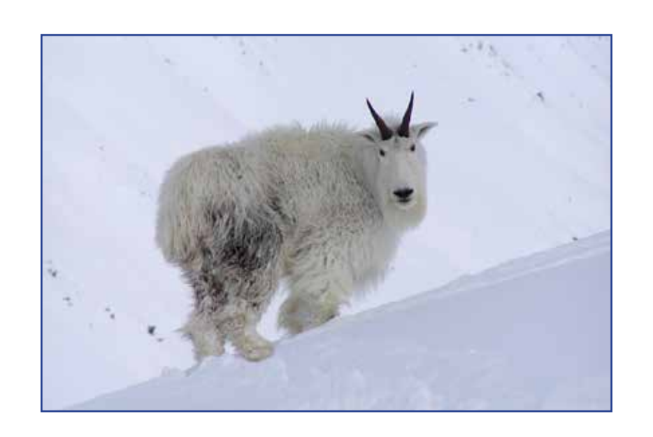
Billy or Nanny?