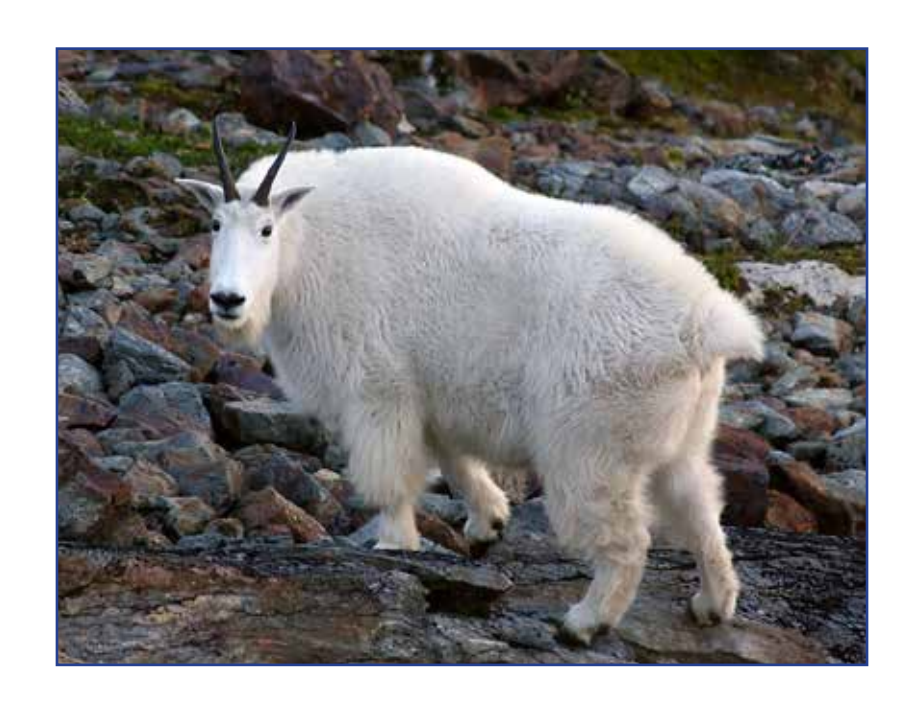
Billy or Nanny?