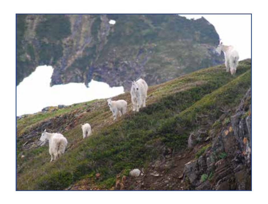
Billies or Nannies?