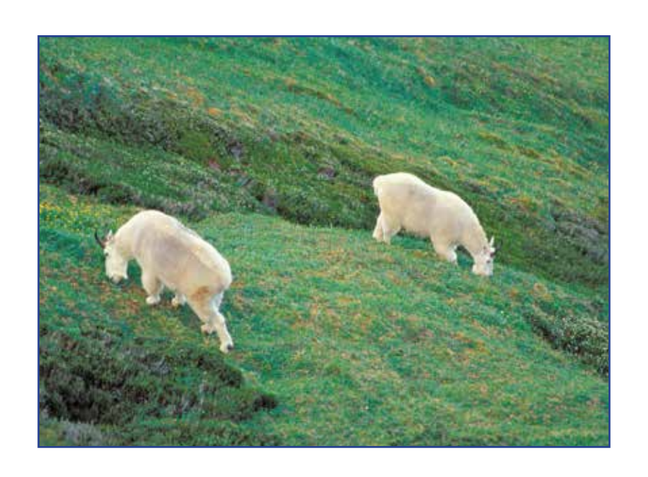
Answer #17 Two billies, early summer