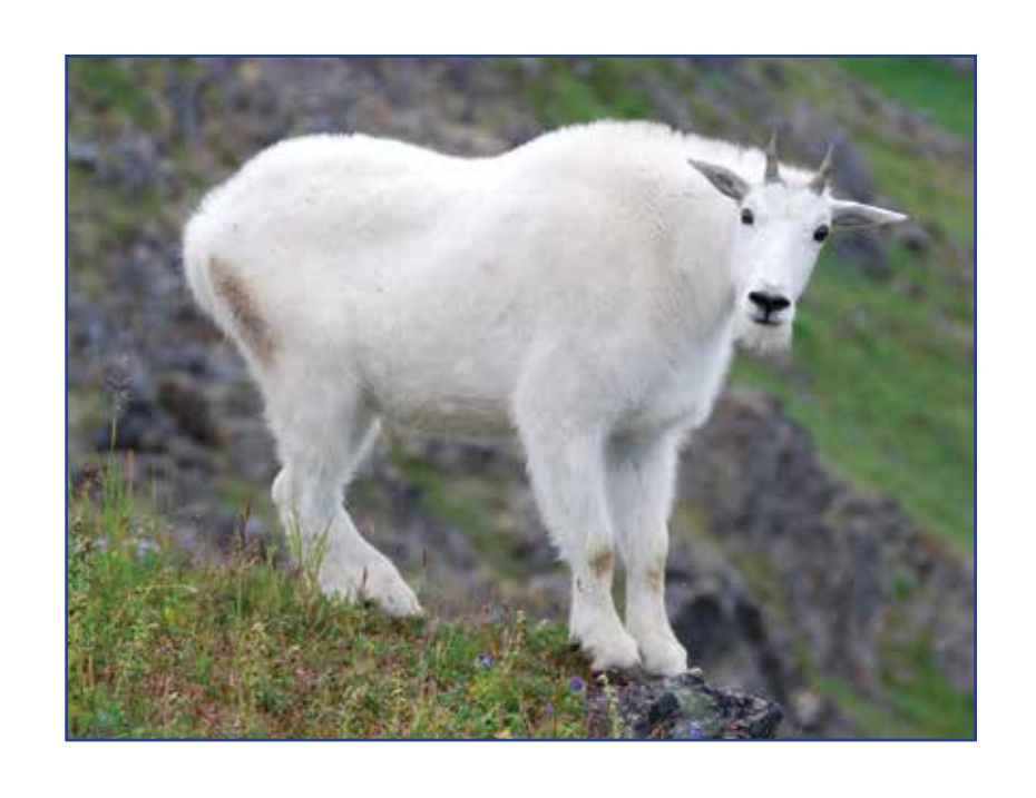
Answer #4 Yearling nanny, July

A yearling's horns are similar in length to its ears.