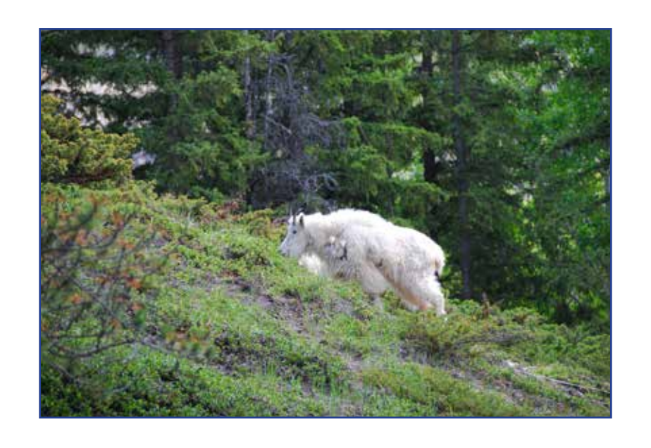
Billy or Nanny?