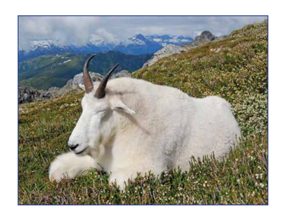
Billy or Nanny?