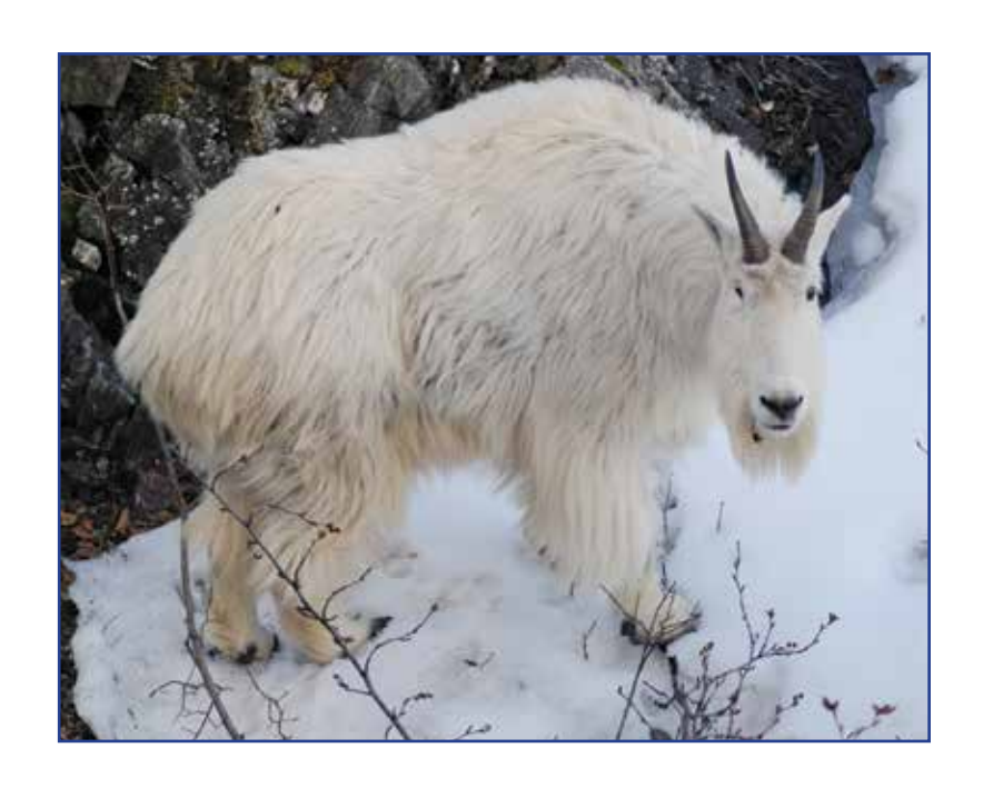
Answer #9 7-year old billy, March

Gradual curve to entire length of horns, horns are thick throughout length, bases are large and close together.