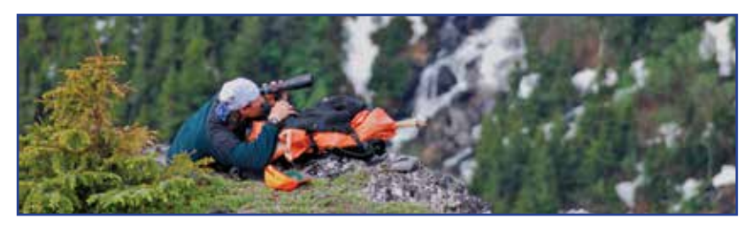
Alaska State Regulations mandate that the horns, hide or antlers may be taken out of the field ONLY after the meat is packed out.