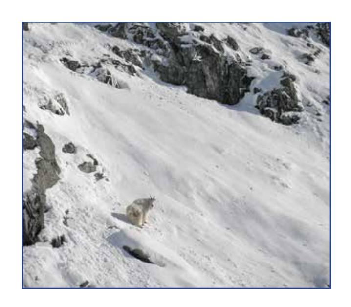
Answer #16 8-year old nanny, October

Distance is too great to realistically identify the sex and there is possibility of severe avalanche danger. Don't take this shot.