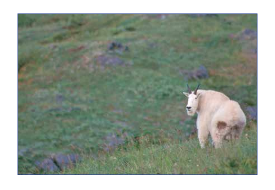
#15 Billy or Nanny?