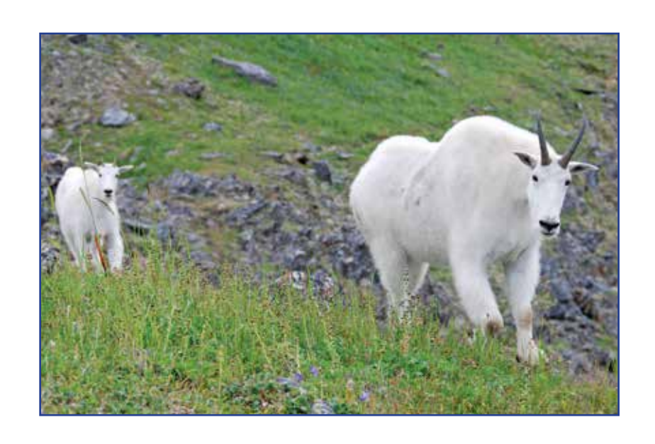
Answer #6 Yearling and nanny, July

Nanny has straight, thin horns with wide space between bases.