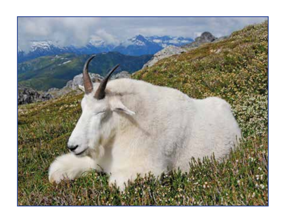
Answer #2 7-year old billy, August

Bases are large and close together, thick through entire length, gradual curve throughout entire length of horns.