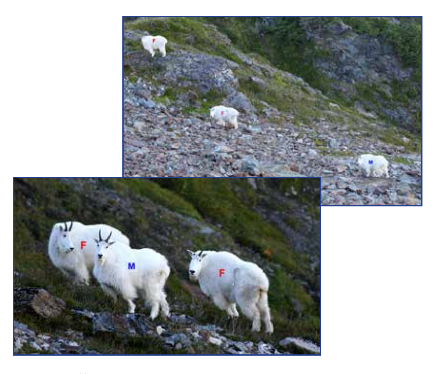
Answer #14 Two nannies and one billy

Note: It is difficult to identify the sex of the goats in the top photo compared to the bottom. The distance and backdrop pose challenges in identifying the sexes. A good scope and taking the time to observe more closely would increase positive identification. These two photos are the same animals, but in different configurations. In the lower photo, shooting at the billy could result in hitting the nanny standing behind it.