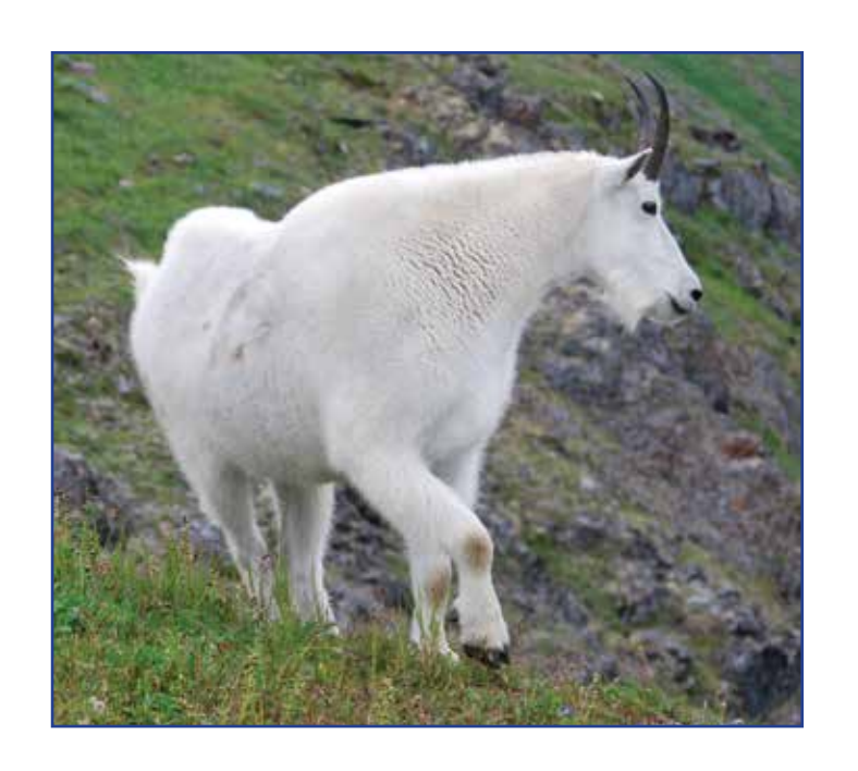
Billy or Nanny?