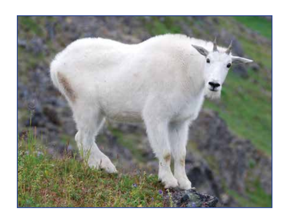
Billy or Nanny?