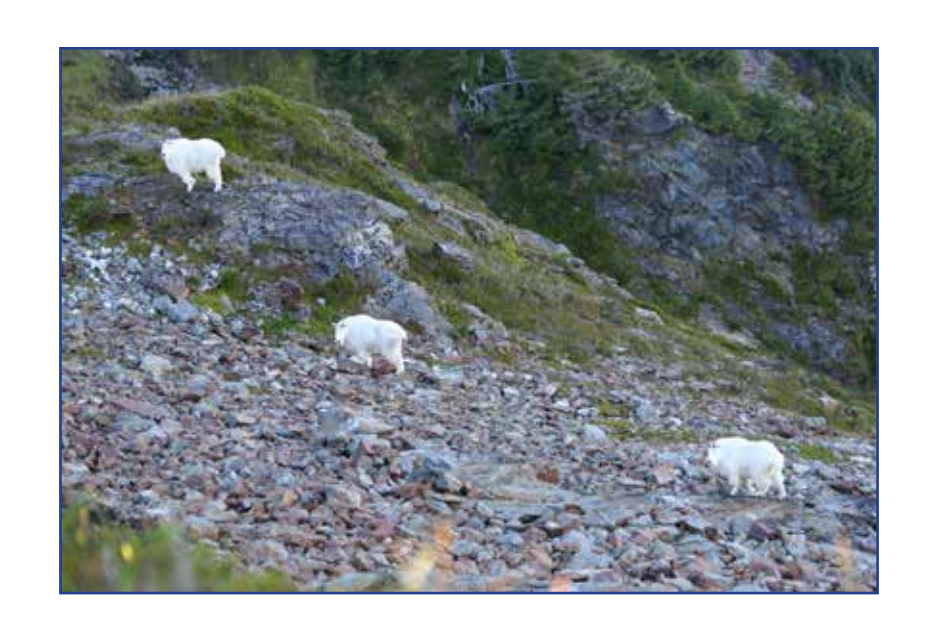
#14 Billies or Nannies?