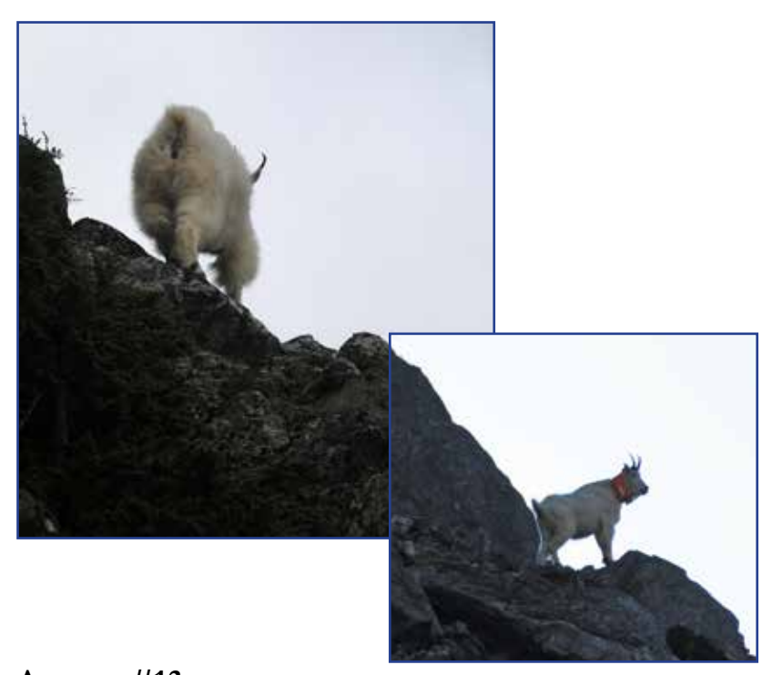
Answer #13 11-year old nanny, August