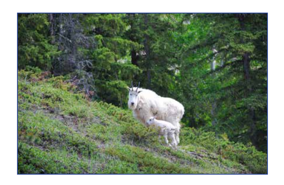
Answer #1 Nanny and kid

Straight, thin horns with wide space between bases. Take your time to watch the animal and be 100% sure there is no kid. It is illegal to harvest a nanny that has a kid!