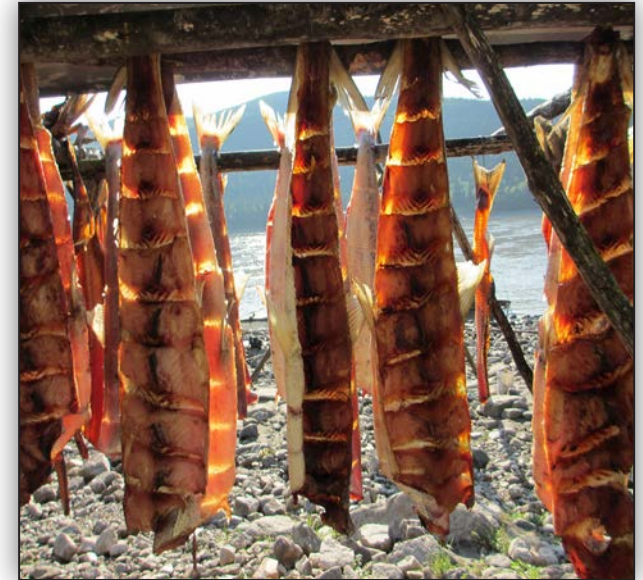
Alida Trainor, ADF&G

This field guide will help you to identify all species of salmon, whitefish, and sheefish present in Alaska. Species accounts include English and some Alaska Native names, descriptions, color photos, ranges, and more!