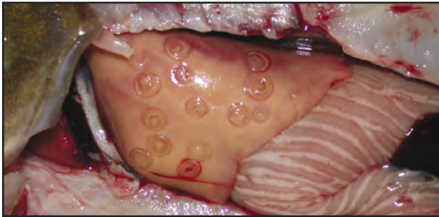
Anisakis third stage juvenile worms tightly coiled in liver.