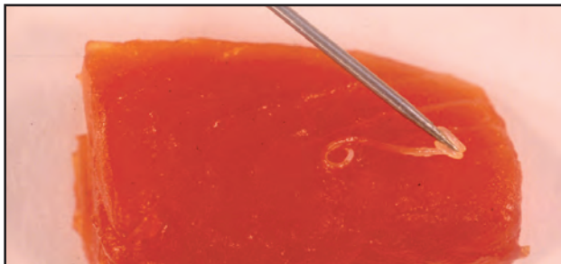
Anisakis third stage juvenile worm being pulled from salmonid muscle.