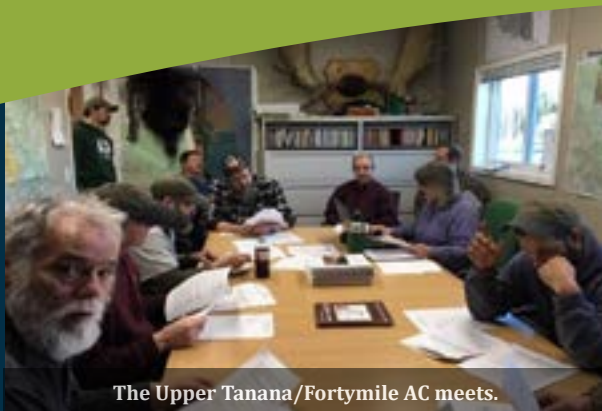
The Upper Tanana/Fortymile AC meets.