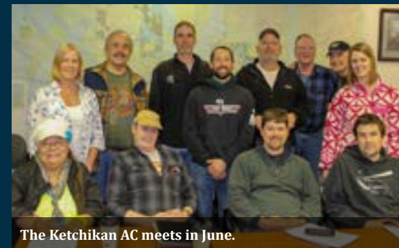
The Ketchikan AC meets in June.

The Ketchikan AC had been dormant for several years but starting last fall, the AC sought out community-wide participation as part of their revitalized efforts. They've taken on issues around king salmon, herring, deer hunting, and more, providing valuable input to both Boards, and facilitating participation in resource management for Ketchikan residents.