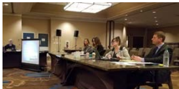
Boards Support staff answering questions for the Joint Board.