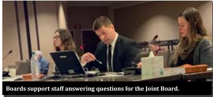
Boards support staff answering questions for the Joint Board.