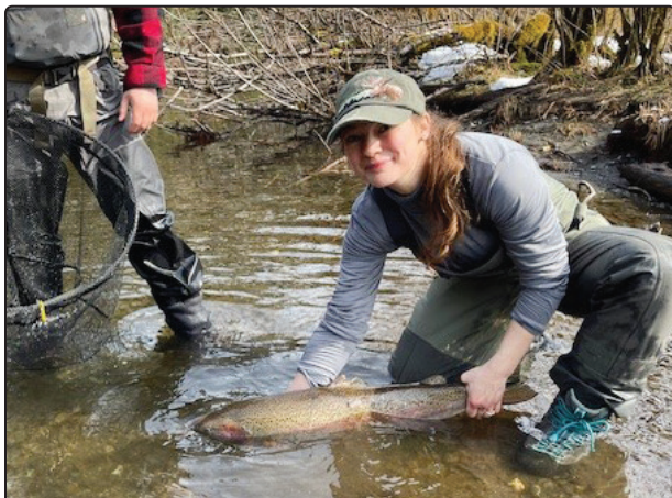
Beautiful steelhead trout from the Situk River.