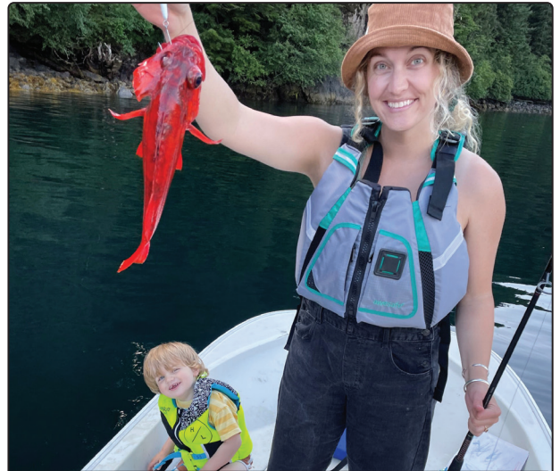
Just a little family fishing fun on the ocean.