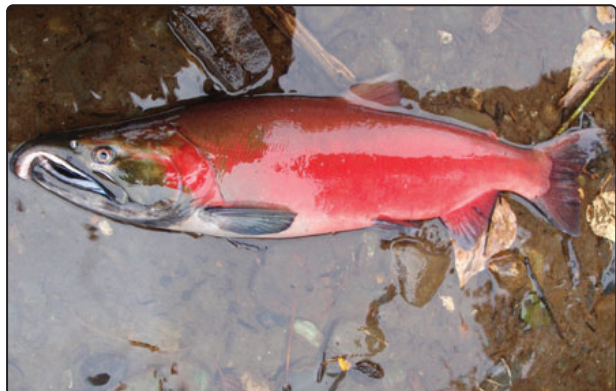
A beautiful spawned colored coho salmon.