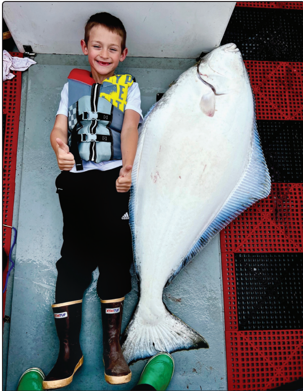
Successful day of halibut fishing for this angler.