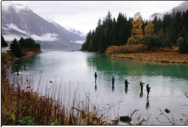
Fishing for coho salmon at Chilkoot River.