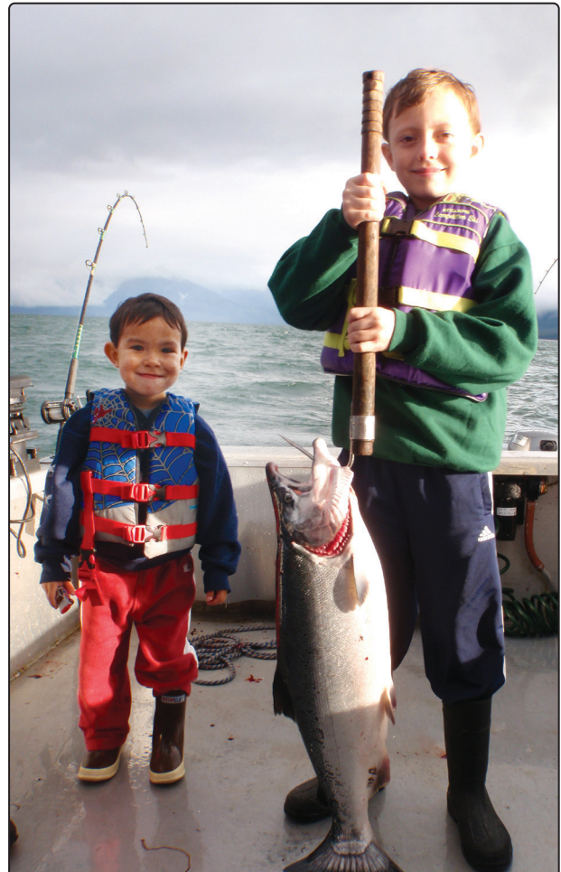
Make memories by taking your kids fishing.