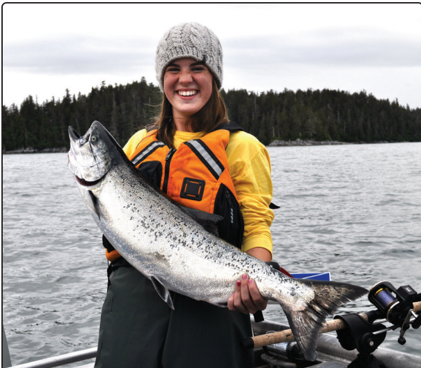
Dime bright Chinook salmon equals all smiles.