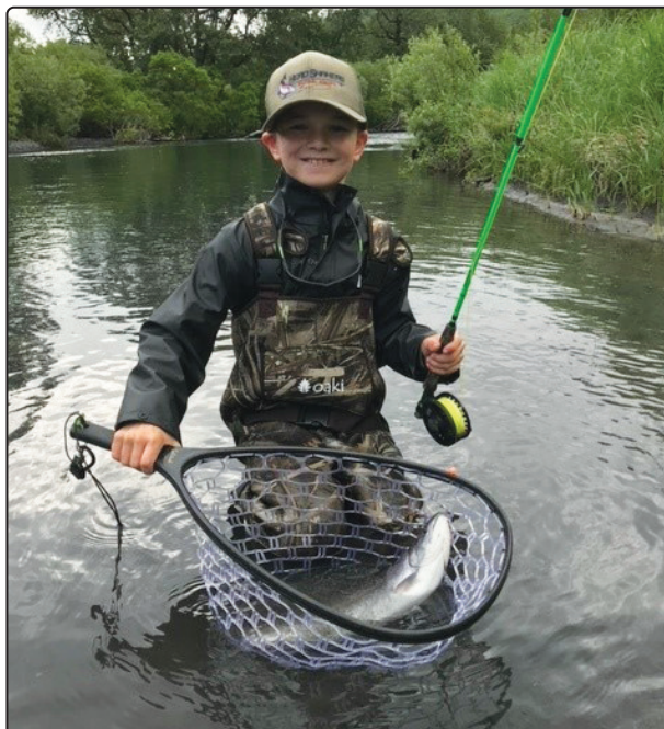
Fly fishing for Dolly Varden at Salonie Creek.