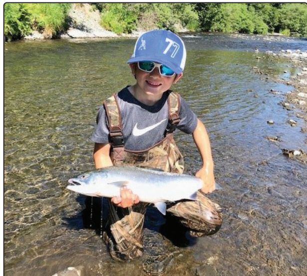
Fly fishing success at Saltery Creek.