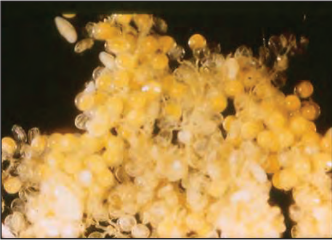
Higher magnification of king crab eggs infested by Carcinonemertes regicides