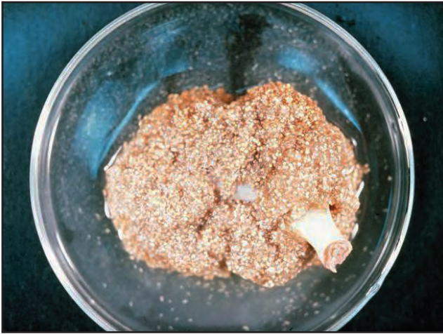
Egg mass of a female red king crab infested by Carcinonemertes