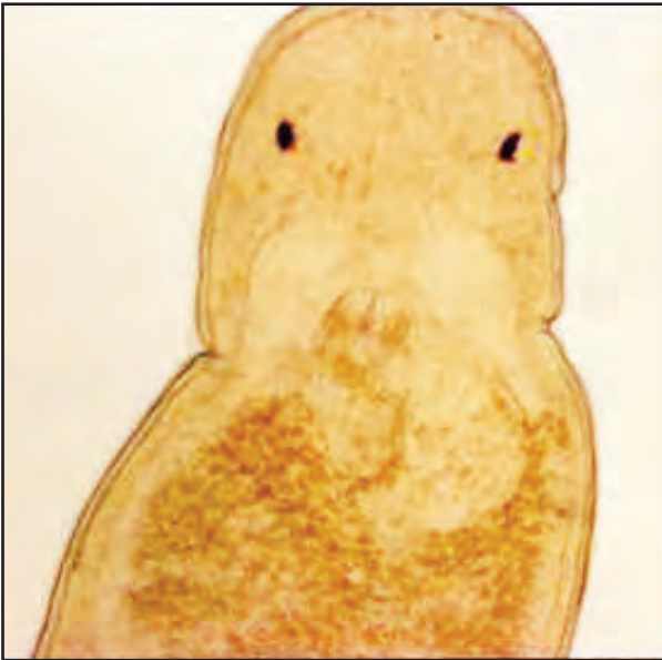
Higher magnification of single Carcinonemertes regicides worm