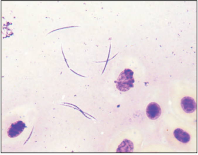
Fusobacteria stained with Giemsa showing typical fusiform shape with pointed ends and beaded appearance, X 1000.